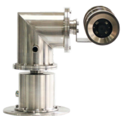
Explosion-Proof PTZ 防爆小型迴轉台