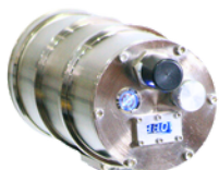
Explosion-Proof Small Size Camera 防爆小型攝影機

無論多麼特別的需求，我們都能提供絕佳的客製化解決方案，節能減碳進而提高效率與品質，達成AI智慧監控環境。