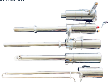
Heating Furnace Inside Camera System 加熱爐內監視攝影機系統